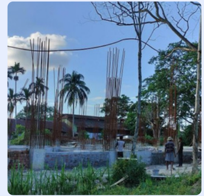
Onsite project images

The project showcases a great demonstration of embracing a holistic approach to patient care and focusing on the needs of the users. This ambitious 100-bedded hospital project in 15000 sq. feet-built area, which started in 2022, witnessed the artisans of construction shaping foundations that will cradle dreams of recovery.