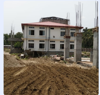
Onsite project images

In the hushed corridors of possibility, where blueprints and dreams weave, the hidden architects of innovation meticulously crafted the harmony of an engineering college's destiny. Behind the curtains of imagination, the project took its first breath in January 2020, exhaling a design brief filled with visions of grandeur. With a built-up area of 220493.9 sq. feet, the academic building comprised of classroom function, laboratories, shared functions, auditorium, library including residential facilities hostels, play areas, dinning, common rooms, etc.